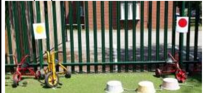
Colour-coded equipment for each