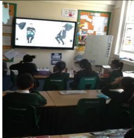
Ad-Duha watching NSPCC video and understanding the importance of speaking out.

The children took part in a really important week and gained a greater understanding of the effects of bullying and how to stop it. This year's theme was 'United against Bullying'. The children know that if we unite and come together to tackle a common challenge, then change is possible. Bullying has a long-lasting effect on those who experience and witness it. But by channelling our collective power, through shared efforts and shared ambitions, we can reduce bullying together. The children now know that by coming together we can make a difference. We are all a piece in the puzzle, and together, we are united against bullying. Understanding that power is when we all work together. When we do so, we can ensure that no child ever has to experience bullying again. We can feel empowered by everyone playing a part in combating bullying, no matter who you are or where you're from - you can make a difference to someone's life. It should be seen as our collective responsibility.