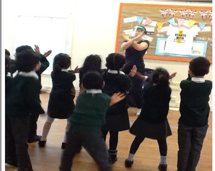
An-Nur acting out different emotions for others to guess (sad, angry, etc.)