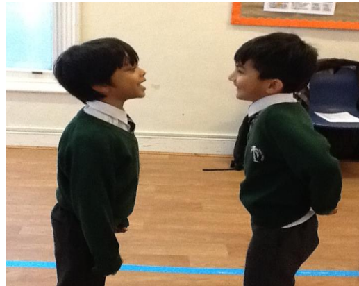
AnNur making eye contact and speaking confidently (Stop I don't like it)